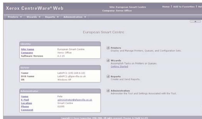
Xerox CentreWare Web is web based software that installs, configures, manages, monitors and reports on the networked printers and multifunction devices throughout the enterprise – regardless of the manufacturer.

For small offices who have little or no IT support, new multifunction system systems must be easy to setup and deploy. The WorkCentre 4118 is simple to connect directly to a PC or Mac via USB or parallel and installing the drivers and management software is easy with the included installation and setup CD. WorkCentre 4118 multifunction systems with the network kit easily integrate into your network and are also easily installed to client PCs with the included driver installation CD.