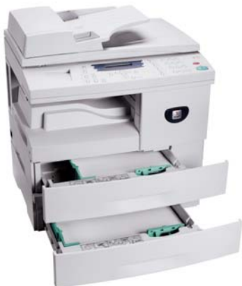
The WorkCentre 4118 offers paper capacity of up to 1,200 sheets - helping you maximise productivity.

The paper handling capabilities of the WorkCentre 4118 are a critical part of overall productivity of the system. Paper capacity can be tailored for your environment, with 650 sheets standard (100-sheet bypass tray, 550-sheet paper tray) and 1,200 sheets maximum (with optional second 550-sheet paper tray).