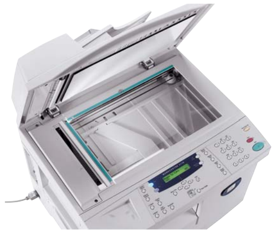
The WorkCentre 4118 brings full-featured copying, with faxing and scanning capabilities, to your office environment.

The WorkCentre 4118 comes with fax functionality as standard. 33.6 Kbps transmission speeds, compression methods including MH, MR, MMR, JBIG and JPEG and 8 MB of dedicated fax memory create a high-performance fax solution. Up to 13 redial attempts can be set to occur in 1 to 15 minute intervals to help your faxes reach their destination without manually resending. 200 speed dial settings also help ease the process of sending faxes and advanced features include the ability to send colour faxes, the ability to receive confidential faxes, 72-hour battery backup, timers for delayed transmitting and sending batch files. The WorkCentre 4118 also enables setting up password protected mailboxes for storing frequently used documents, fax forwarding, fax polling and more.