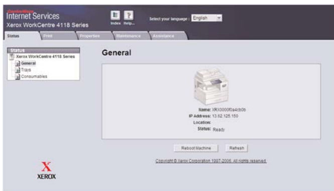
CentreWare Internet Services is a web server embedded in every WorkCentre product. You can submit and monitor print jobs and machine status from anywhere – from your intranet to the World Wide Web.

Xerox CentreWare® Web management software is a powerful enterprise-level management solution. CentreWare Web is optional, free software that eases the chore of installing, configuring, managing, monitoring and pulling reports from the networked printers and multifunction systems through the enterprise – regardless of vendor.