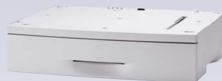
Additional 550-sheet Paper Tray