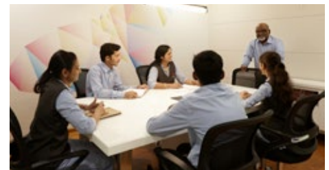
A meeting in the New Point Cards and Printers conference room