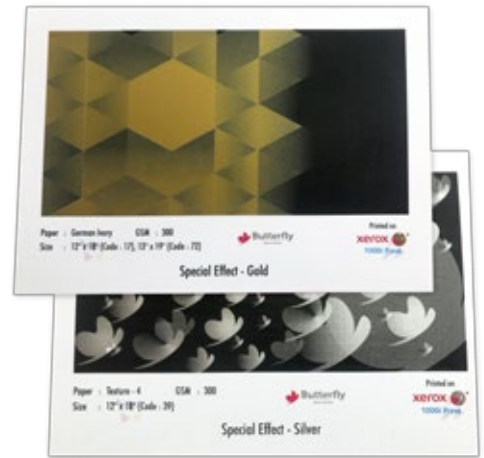
The New Point Cards and Printers sample album features examples of metallic gold and silver.

To learn more, contact your Xerox representative or visit www.xerox.com .