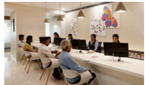
The front desk at New Point Cards and Printers

One capability was missing from the shop, however. "The whole market has shifted to the use of both offset and digital printing," Shreyas said. "If you don't have machines in both domains, you are missing some of your customers' big requirements."